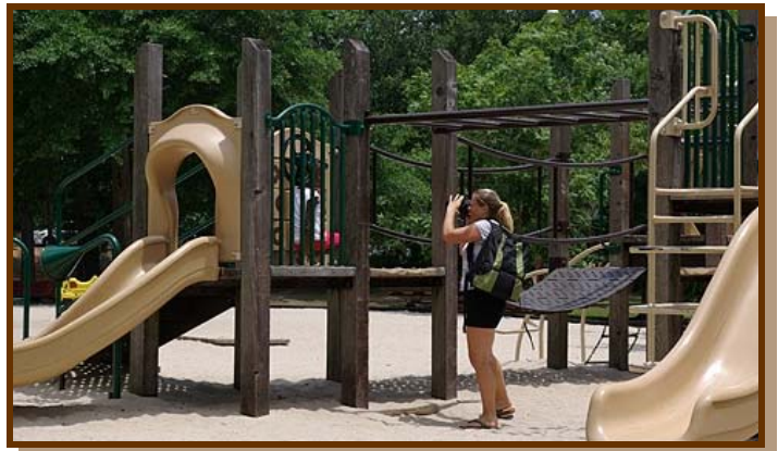
Heart Gallery Photographer Hansje Gold-Krueck